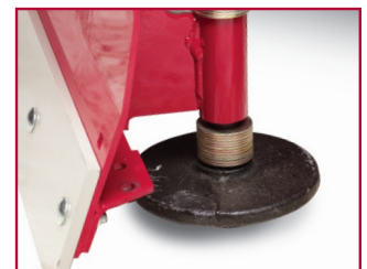
Adjustable cast iron skid shoe discs