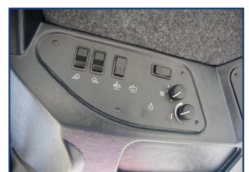
Switches conveniently located in roof