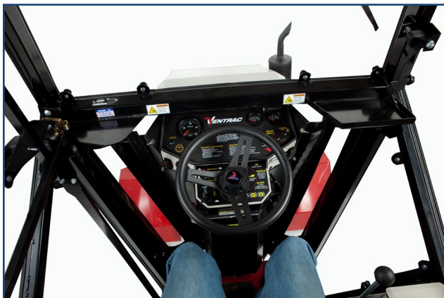
Exceptional visibility and interior room

Featuring tempered safety glass, removable doors, heavy duty front wiper and interior lighting, the quality and performance you come to expect from Ventrac shines through. Standard with the KW350 cab are removable doors as well as removable side windows for year round operation and driver comfort.