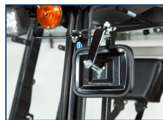
Optional Side Mirrors