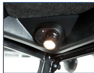
Standard Interior Light