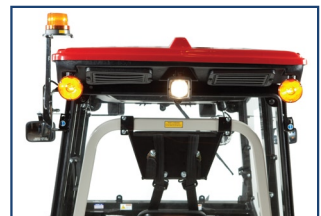
Optional Rear Lights