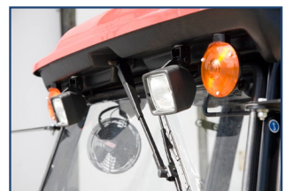
Optional Front Lights