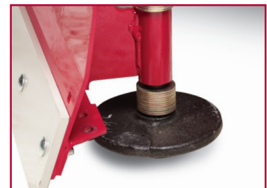
Adjustable cast iron skid shoe discs