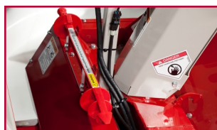
SnoStik™ for dislodging clogged snow