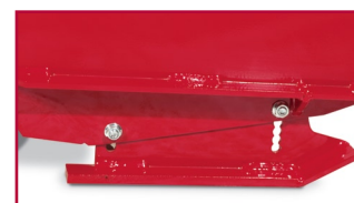
3/8" thick adjustable side skid shoes