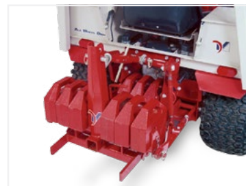
Optional Weights (up to six 42lb weights)

All specifications subject to change without notice or obligation