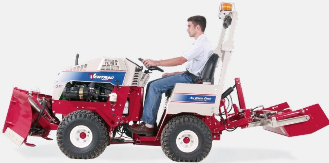
Rear mounted attachment on 3-N-1 Adapter shown with optional Hydraulic Top Link