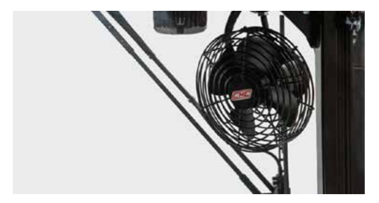
Optional Defrost Fan