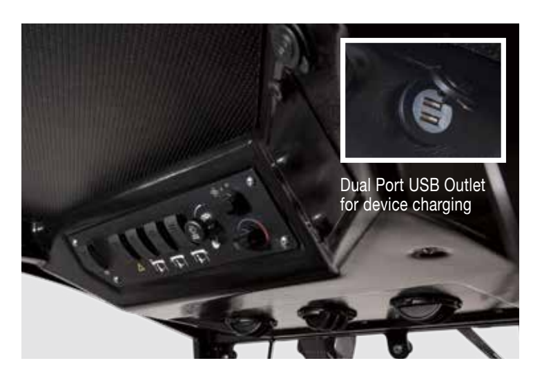
Easy Access to Switches and Fuse Panel