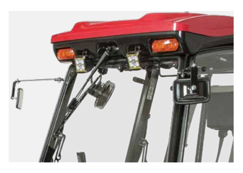
LED Work Lights, 2 Front and 1 Rear