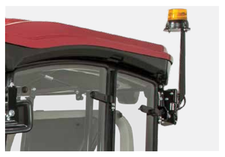
Fully Sealed, Breakaway Mounted Optional Strobe Beacon