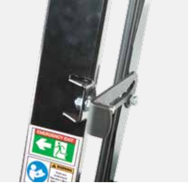
3 Window Latches for Ventilation