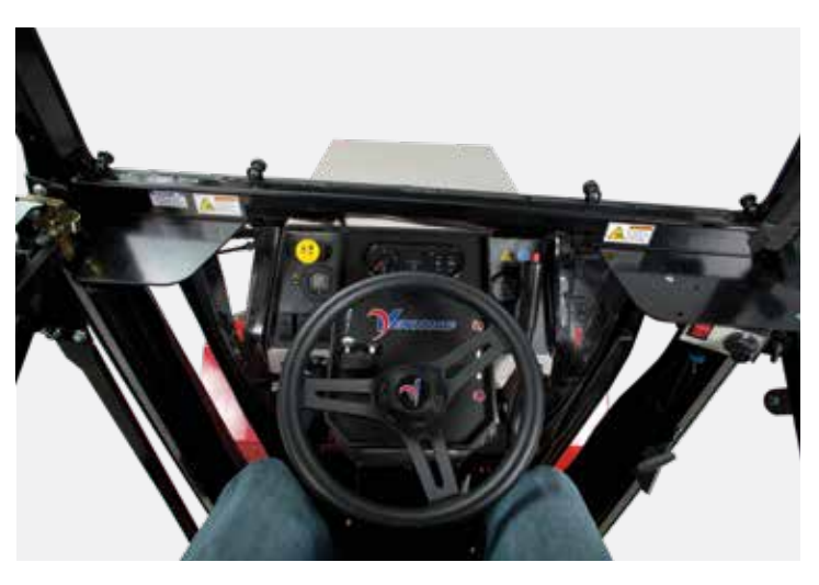
Exceptional Visibility and Interior Room