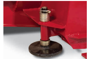
One piece, shaft mounted adjustable cast iron skid shoe discs

Ventrac Snow Blowers are built for commercial snow clearing operations of sidewalks, driveways, and other areas. Available in width options of 48" and 52", these two stage snow blowers feature a 16" diameter solid auger for best snow transfer, a large 20" diameter fan, and the ability to launch snow at distances up to 40 feet.